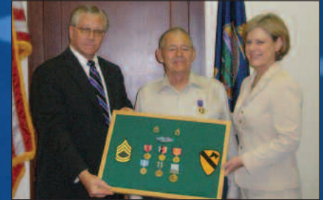
Congresswoman Nancy Boyda presents medals to a constituent after his family reached out to the office seeking help recovering lost medals.

(Advice for Resolving Military Situations)